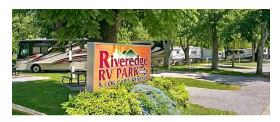
Riveredge RV Park

Pidgeon Forge, TN September 27 - 30, 2022