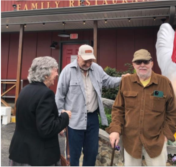
A few candid shot from March 13 th :