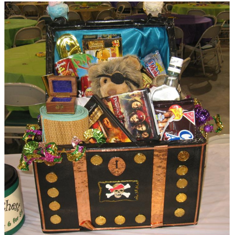
The theme basket