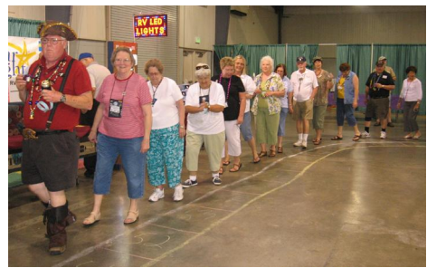
"Walking the Plank" cake walk