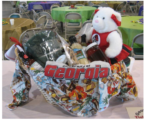
The Georgia basket