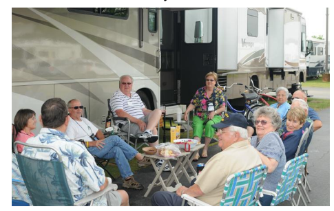
Floridians hold a rally of their own outside their coaches