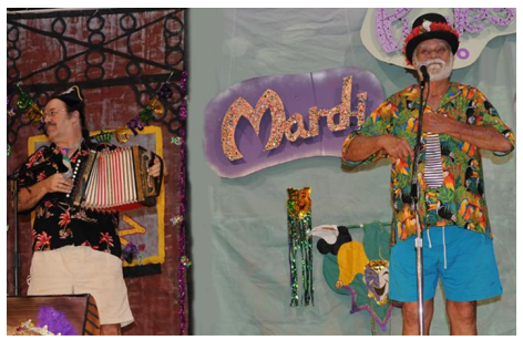
The Nawlin's Po Boys