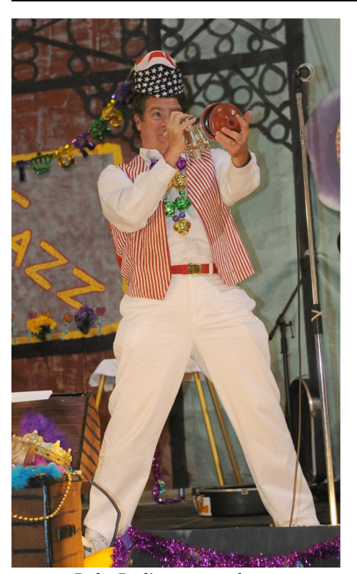
Ruby Red's trumpet player