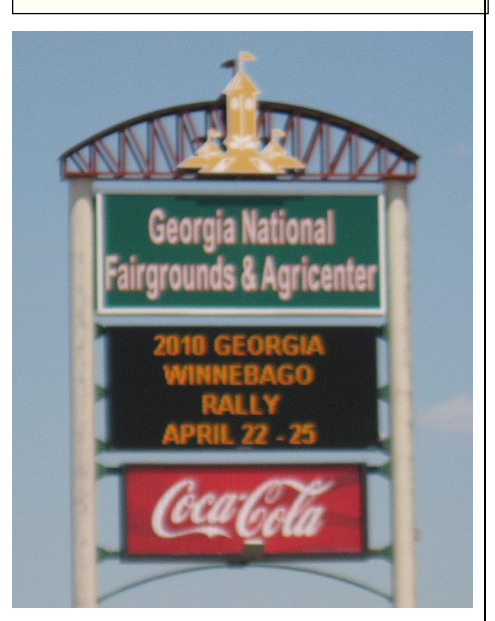
Marquee at Agricenter on I-75