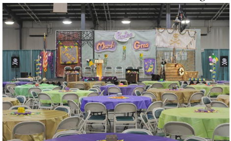
They did a great job. Everything inside Heritage Hall was "just right".