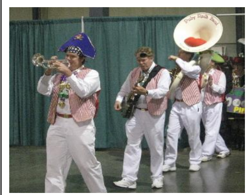
The Ruby Red's Band led the parade

The "Ride the Gator" game was cancelled due to rain, and so was the Mini Mardi Gras Parade. However, after another wonderful catered dinner, the entertainers for the night led the costumed pirates as they circled the tables in Heritage Hall. The pirates threw beads, candy, moon pies, and other items, just as if they were an authentic parade. We just don't give up!