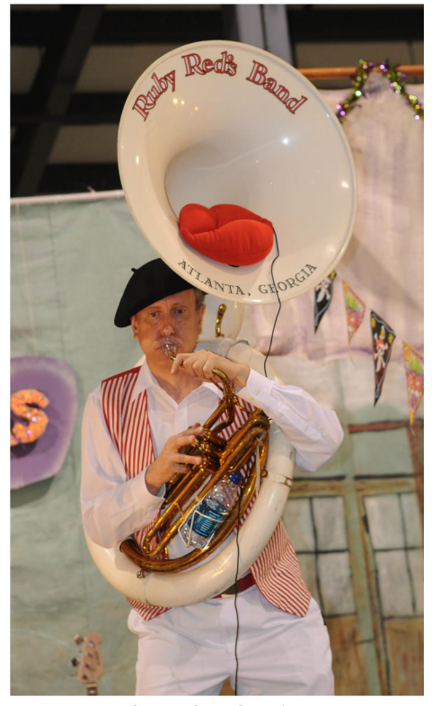
Ruby Red's tuba player