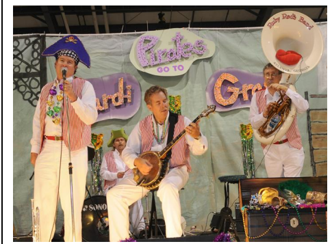
The Ruby Red's are superb entertainers