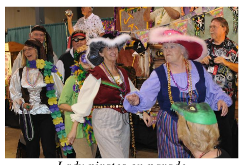
Lady pirates on parade