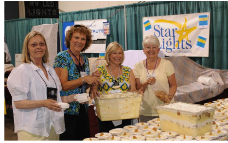
These volunteers helped with the Friday night catered dinner. Thanks girls!