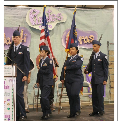
Color Guards present the colors at the opening ceremony