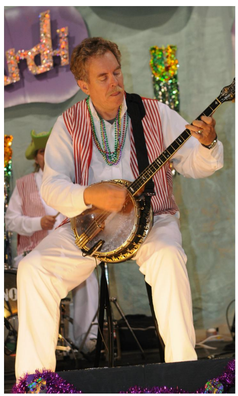
Ruby Red's banjo player