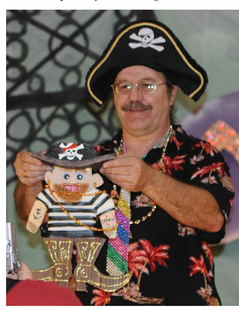
Shorty was found again as shown by one of the Nawlin's Po Boys