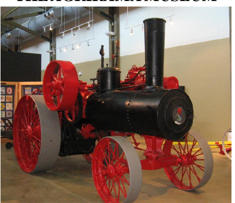
Rumley Steam Tractor - Built in 1915

Over 35 structures have been relocated on this 95-acre site where the present meets the past. It has working farmsteads, blacksmith shop, drug store, with costumed interpreters, and much, much more.