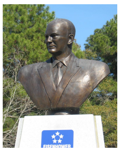
Dwight D. Eisenhower's Monument