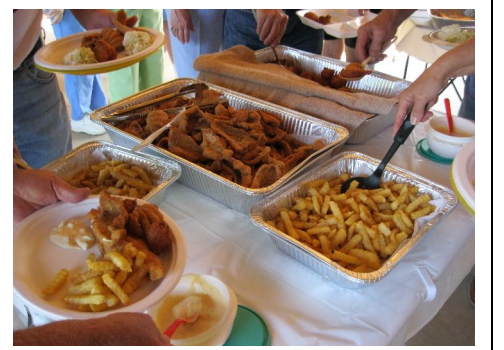
Thursday night fish fry