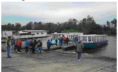
Tours included a boat ride through the Henderson Swamp and lunch at McGee's plus other exciting events.

( Caravan-Cont'd. from page 1 ) along I-10 before heading in mass to the fairgrounds.