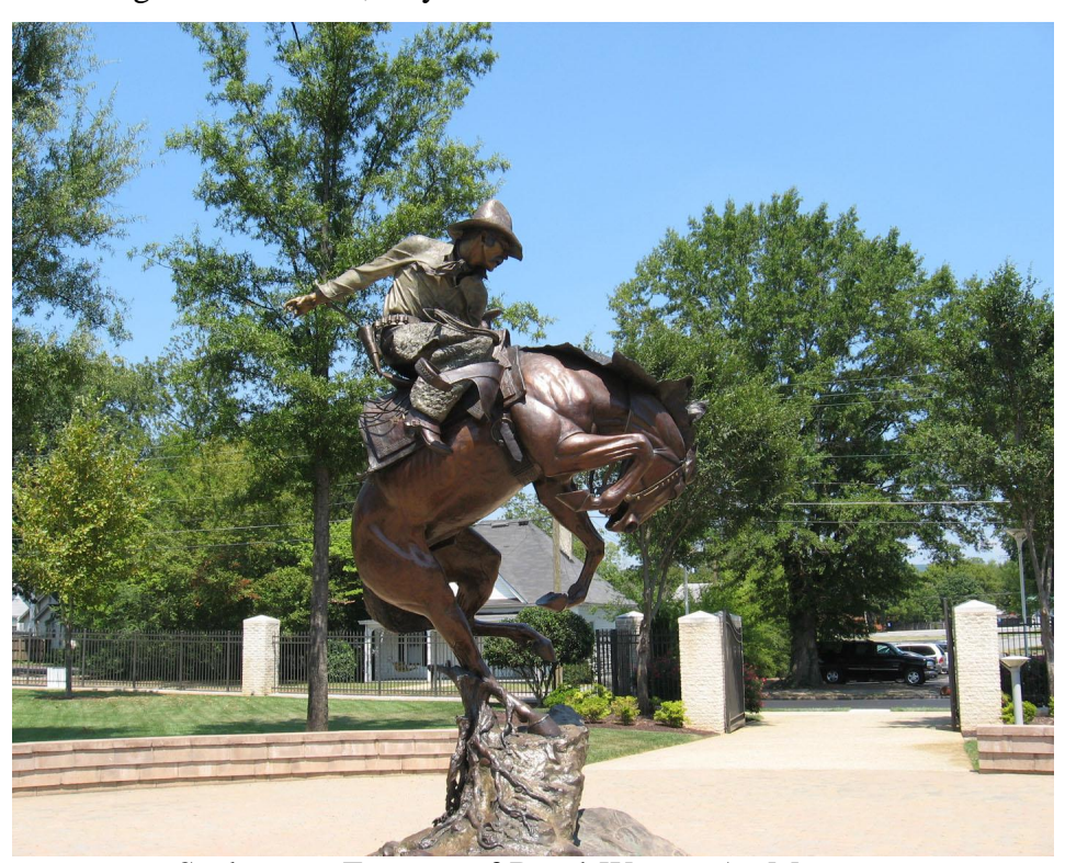
Sculpture at Entrance of Booth Western Art Museum

Part of enjoying historic Adairsville was the GWTW ladies' trip to Maggie Mae's Tea Room (no men allowed) for Saturday lunch. Quiche Lorraine, sumptious salads, a wonderful selection of exotic hot teas, and an unusual dessert called the "hummingbird." Husbands, eat your heart out!