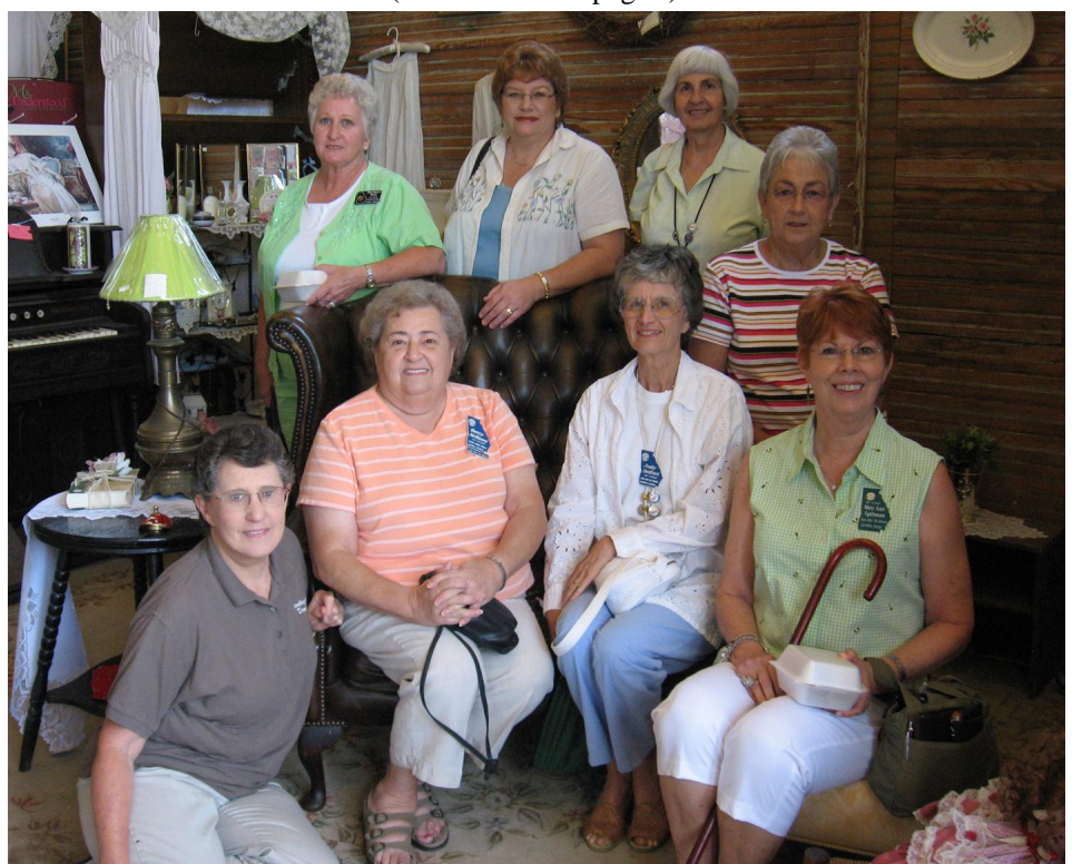
Ladies at Maggie Mae's Tea Room

Part of enjoying historic Adairsville was the GWTW ladies' trip to Maggie Mae's Tea Room (no men allowed) for Saturday lunch. Quiche Lorraine, sumptious salads, a wonderful selection of exotic hot teas, and an unusual dessert called the "hummingbird." Husbands, eat your heart out!