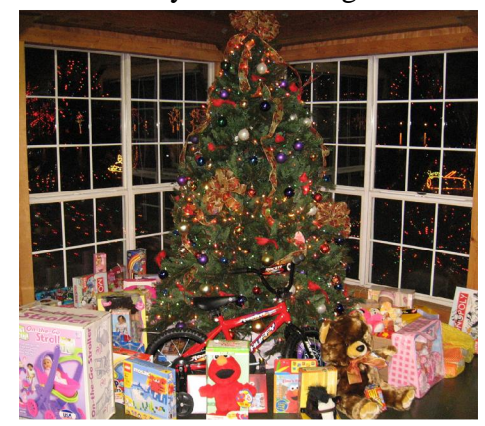
The "Toys for Tots" Christmas Tree