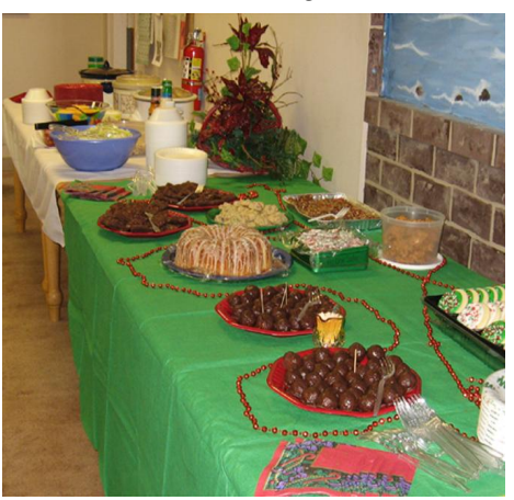
Serving tables all decorated for the season