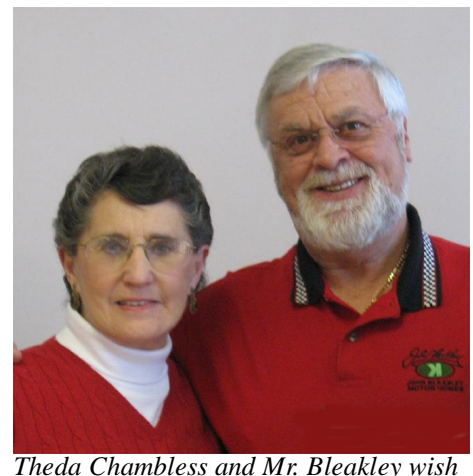
each other a Merry Christmas