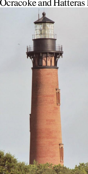
Carrituck Beach Lighthouse

Cape Hatteras Lighthouse The Carrituck Beach Lighthouse is the northernmost lighthouse on the Outer Banks. It was completed in 1875, is 162 feet tall and has 214 steps. Its light can be seen for 19 miles. When the lighthouse was illuminated in 1875, it completed the chain of lights along the North Carolina coast by filling in a previously dark 80mile gap. This red brick structure has never been painted in order to distinguish it in daylight from Brodie, Ocracoke and Hatteras lighthouses.