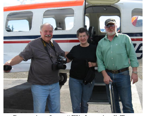
White-water Rafting at Denali Returning from "Flightseeing" Tour

We toured Fairbanks, visited Santa at North Pole to get our order in early, and then left for Denali National Park. On the way we stopped at the unique little village of Nanana.