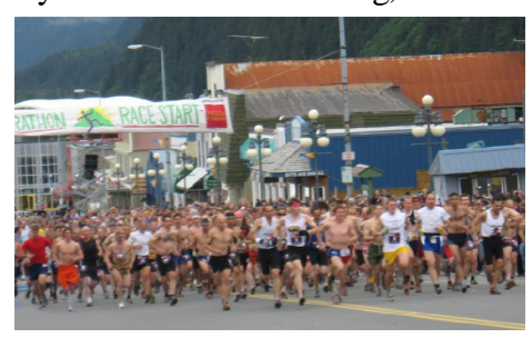
July 4th Mountain Marathon in Seward

The sun was glorious at Denali Park, so we went up in the park by bus and viewed Denali. It was our fourth time to Alaska, but the first to see that elusive mountain. The next day we went white-water rafting, then took a "Flightseeing" tour.