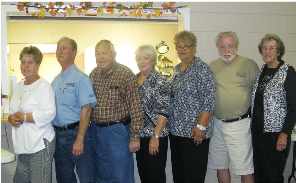
The Homer Bunch - Our Hosts Extraordinaire