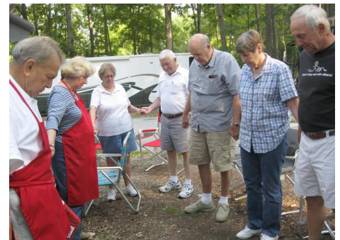
Bowing in thanks for our meal