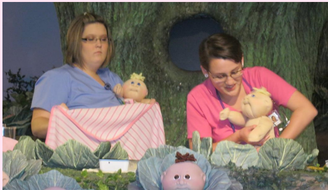
Nurses deliver twin girls at the hospital