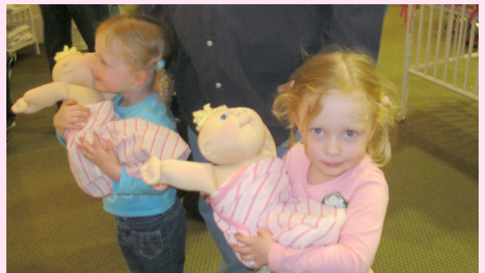
Twin girls awaited delivery of the twin Cabbage Patch babies for adoption