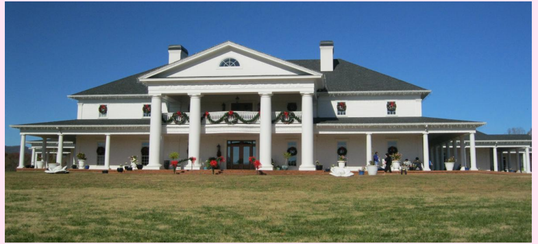
Many of our group went to the Baby Land Hospital where the Cabbage Patch Kids are born and adopted