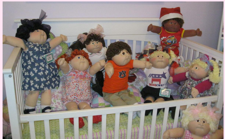
Toddlers awaiting adoption