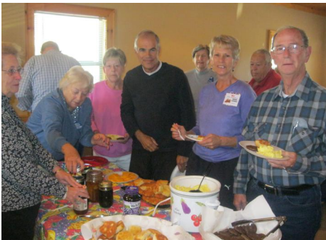
Everyone seemed to enjoy the fabulous breakfast.

Frost didn't keep us away from the fantastic breakfast our hosts prepared for us on Saturday morning. Cheese biscuits, plain biscuits, sausage, scrambled eggs, fruit, coffee and juice hit the spot on that cold morning.