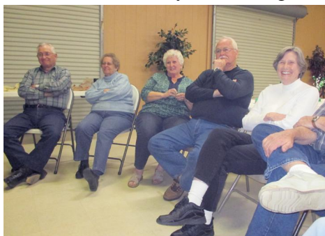
Everyone seemed to enjoy the new game

After dinner we played a game that consisted of each person telling about themselves: their history and what brought them to the present. Sometimes it was hilarious, and sometimes it was sad - but it was always interesting!