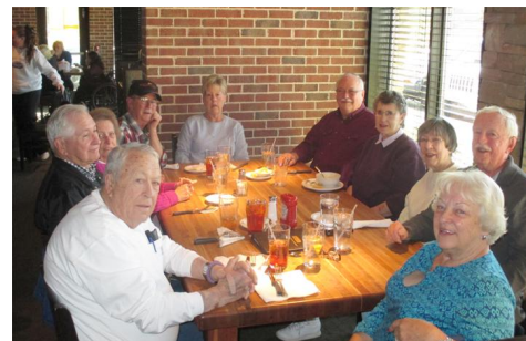
We all enjoyed our Friday evening dinner at Cheddars.