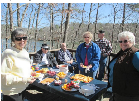
Our group enjoying the sunny afternoon outing.