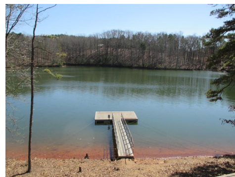
A view from the Burtch's deck