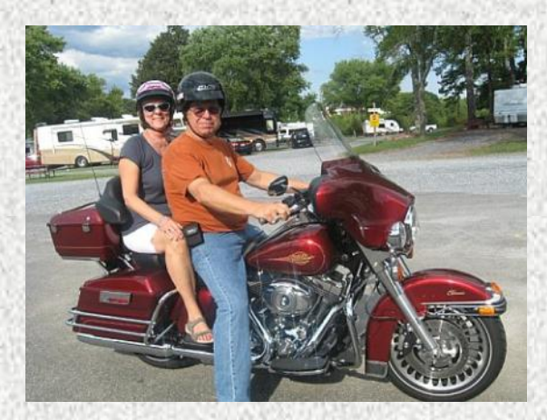
See all the pictures at http://atlantawinnies.gawit.com